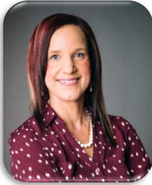
Anna Gould Chair